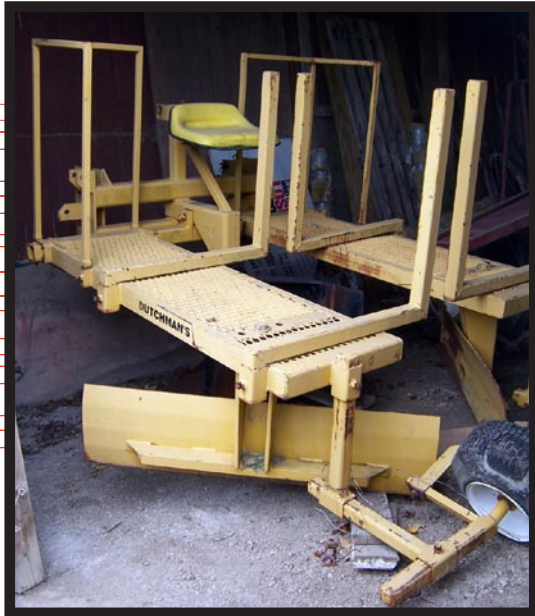
Like New Dutchman Tree Planter with 24" Shoe

Contact Us 419.287.4679 (Office) 419.287.4509 (Fax)